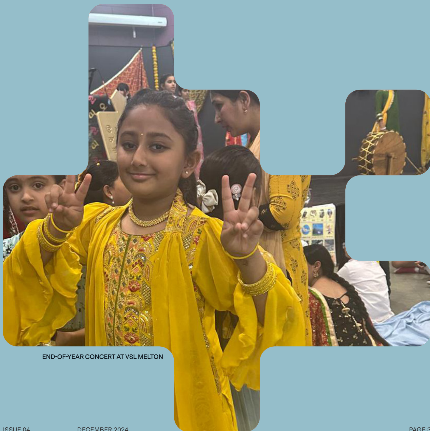
END-OF-YEAR CONCERT AT VSL MELTON