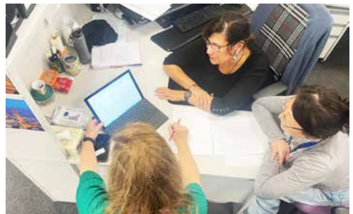
Distance Education teachers working together on the Problem of Practice

Our groups are still at the planning stage of the project looking at data and setting goals. Once this is done, they will further break up into pairs to develop ideas for classroom activities. They will then coordinate their reciprocal peer observations of either a part of an oral lesson, a face-to-face seminar or a webinar. This is a common practice in day schools and we look forward to also making this part of our professional development so that we can further improve our instructional practices and share the wealth of knowledge that our experienced and more recently trained teaching staff have to offer.