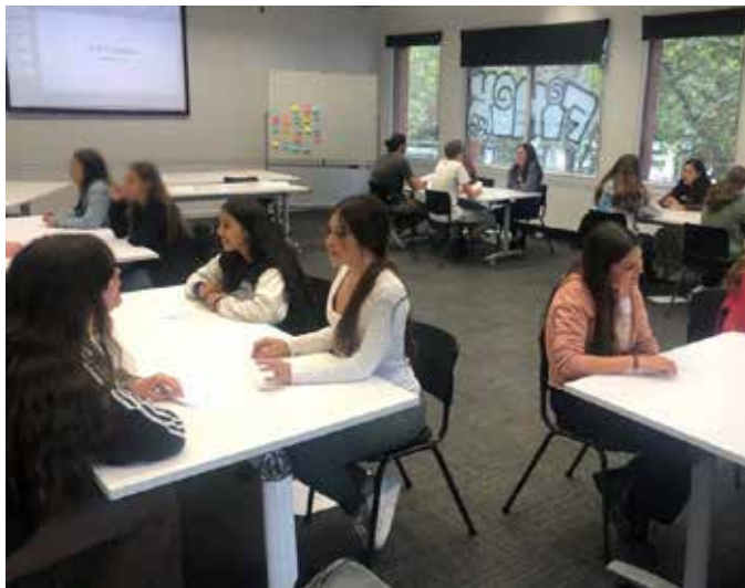
Spanish Distance Education students at our face-to-face seminar

Seven face-to-face seminars have been held for a range of languages in May, among more than 20 so far this year, and there are many more to come across the remainder of 2023. In recent seminars, students have learnt skills to prepare for SACs and exams, practised conversation, conducted peer and self-assessment and worked in groups on tasks ranging from mind mapping to hands-on sentence construction to cultural dancing!