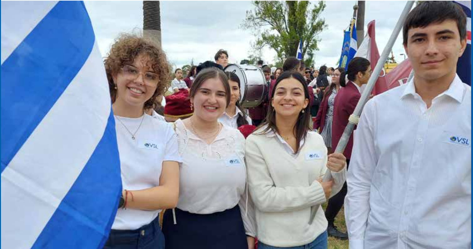
Our students represent the VSL at the Greek National Day Parade at Lakeside Stadium, Albert Park