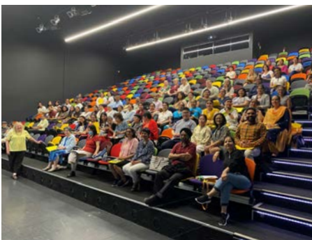
South East – Berwick, Dandenong and Hampton Park