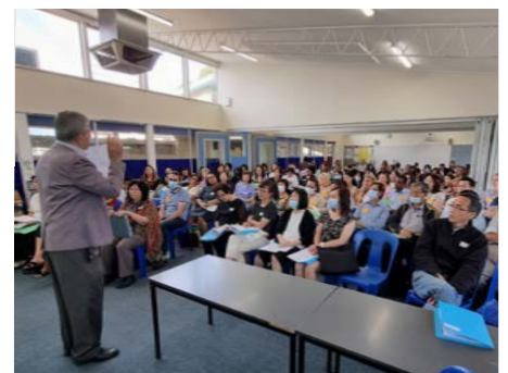
Area South/South 2 - PD Day, January 28