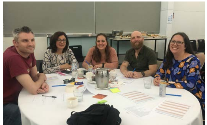
Professional Development Day, December 2022

parents and home school supervisors. We strongly encourage you to access this page and get the conversation started with your child.