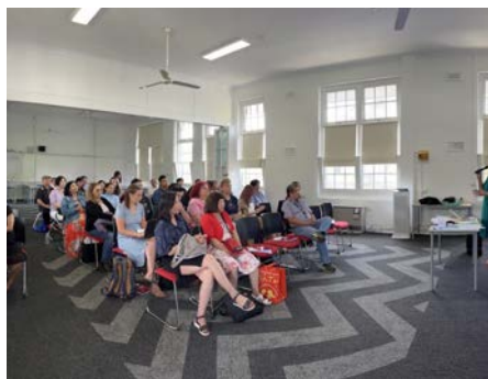
West 1 - Altona North, Ballarat, Footscray, Sunshine