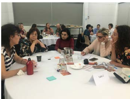
Distance Education Professional Development