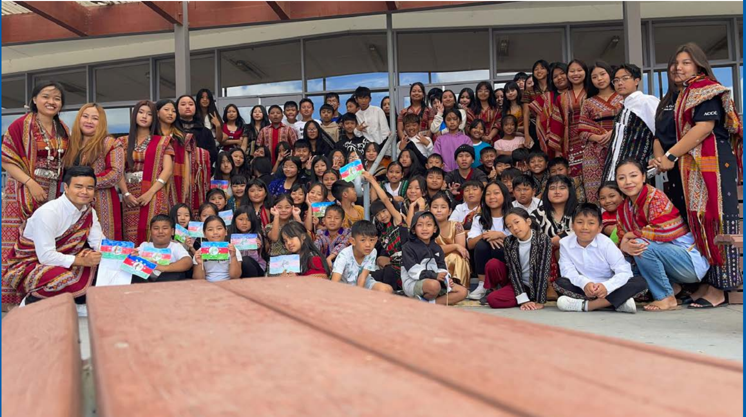
75th Chin National Day Celebration at VSL Sunshine