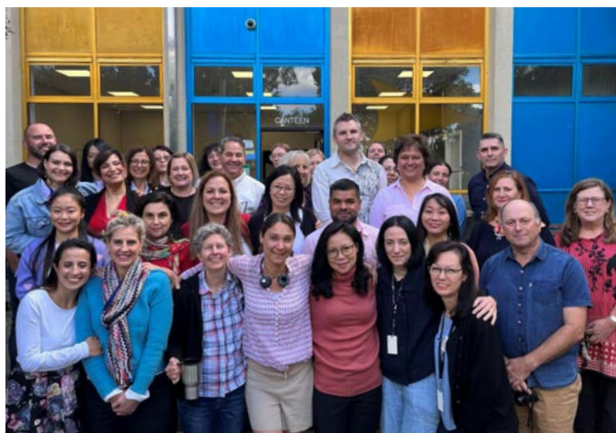
The Distance Education team

Not all changes are difficult, uncomfortable or stressful. We hope that this change makes sense, and we await your feedback across the year. Welcome back to the VSL for the 2023 school year. We look forward to working together with you and your children to achieve new personal bests in language learning this year.